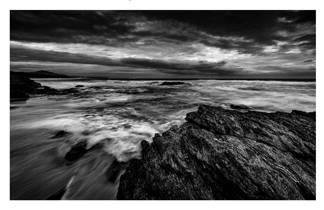
The Wow value is what my Photoshop for Photographers is all about