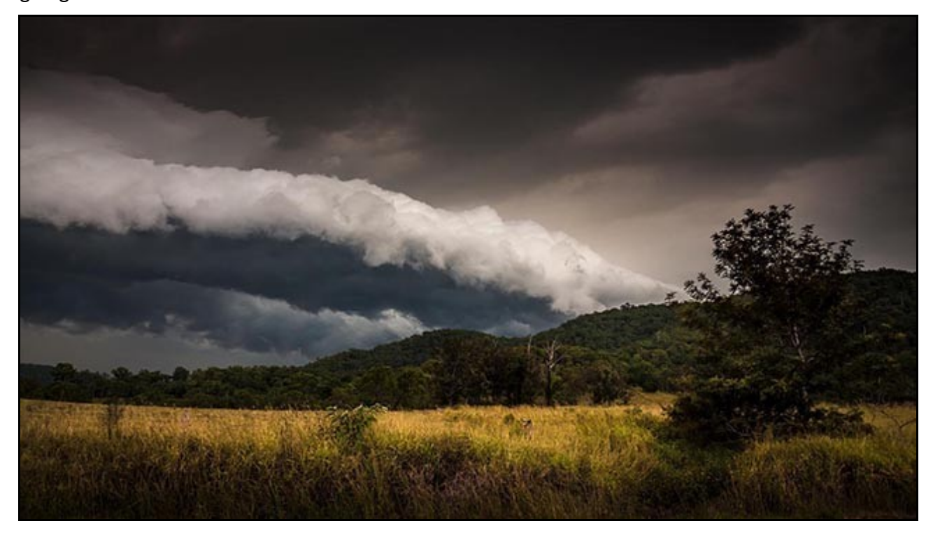
The Storm Season for PC

for some projects, but not all. The art of Audio Visual here is to imply a story. The coming and going of a storm.