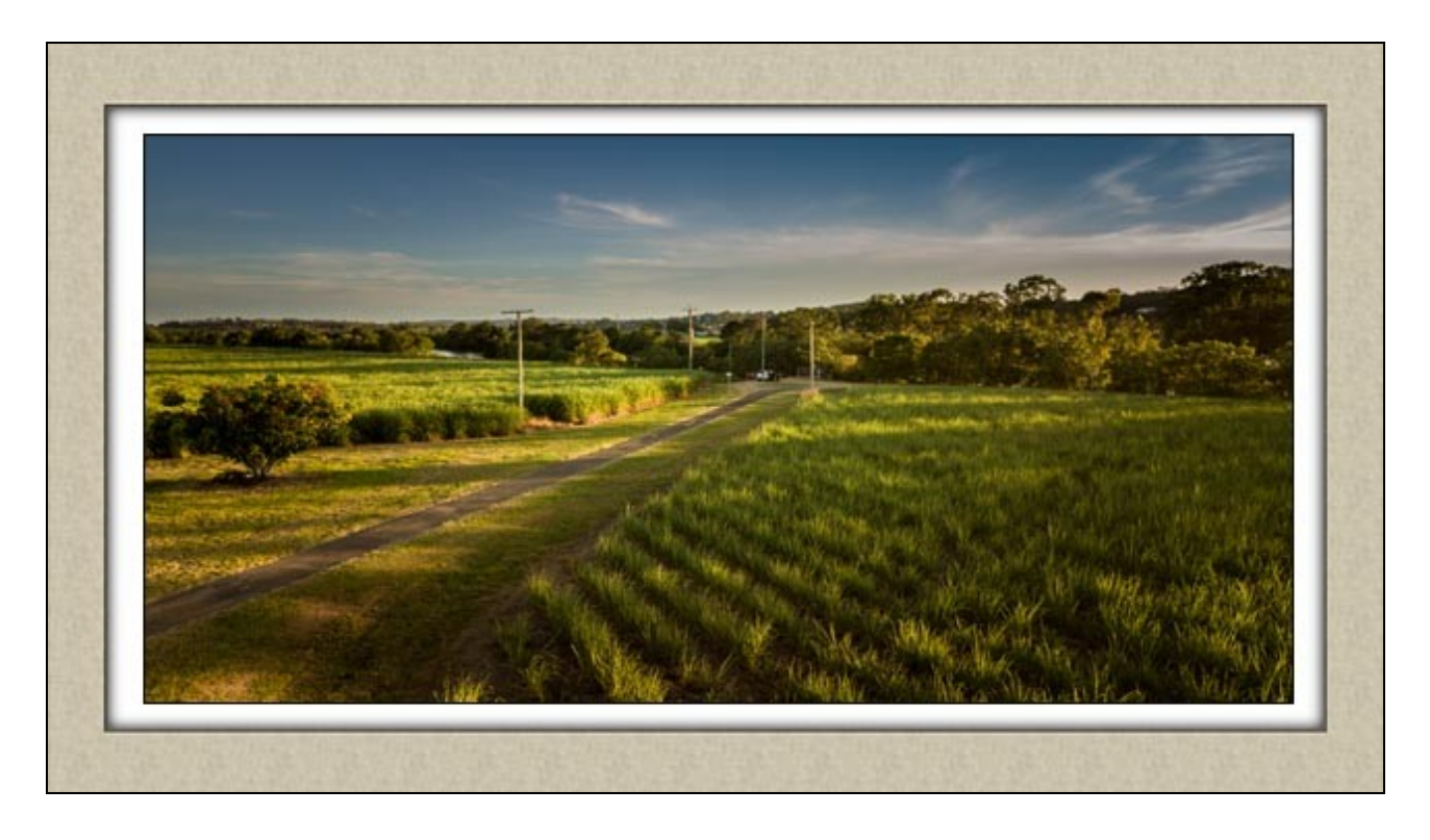
Or, we have a few more elaborate frames if you wish. All the frames are created at HD size 1920*1080

images for a great presentation effect. We have simple frames like the one below.