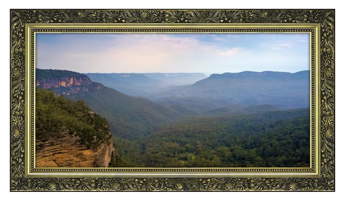
Check out our Introduction video on YouTube HERE